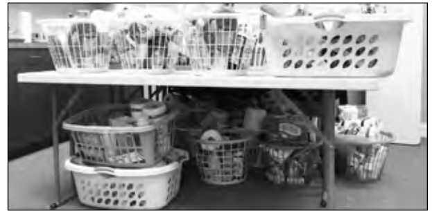
These are elder baskets churches and charges in the Greenwood District of the UMCSC assembled.