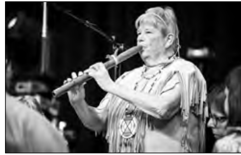
The service featured Native American music and drumming.